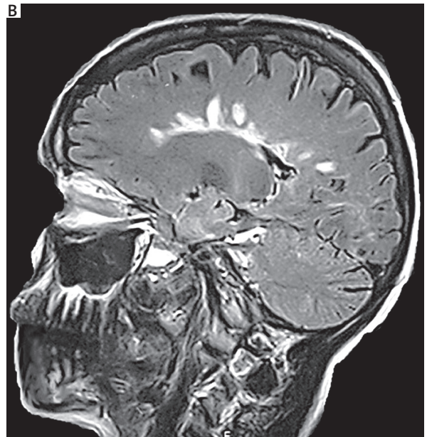
Figure 2 A, B. FLAIR MR images of an MS patient (according to [9])

They are used in order to assess the patient's disability, disease progression, and treatment outcomes as well as the quality of life [10].